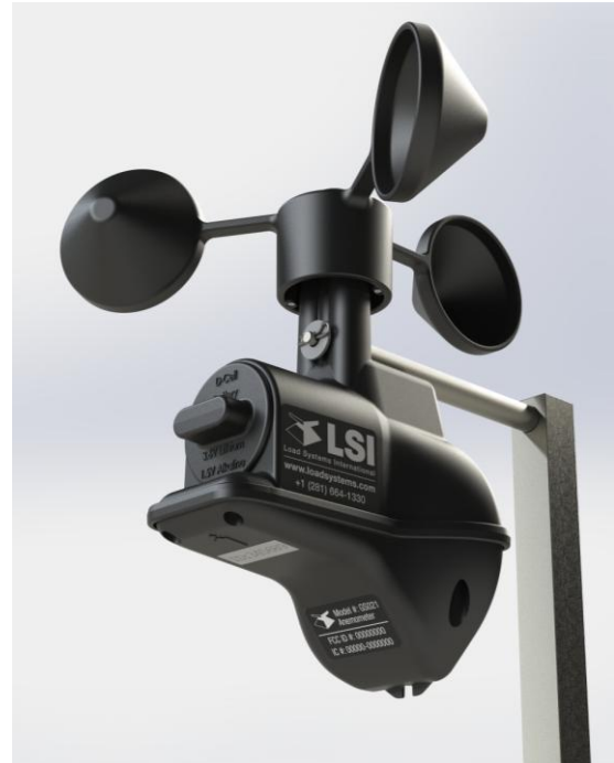
Figure 1, Wireless Anemometer p/n GS025

The GS025 is a magnetically encoded anemometer. The wind speed values are computed from pulses of magnets inserted in the rotor. This means that this anemometer has no adjustment and thus never needs to be calibrated.